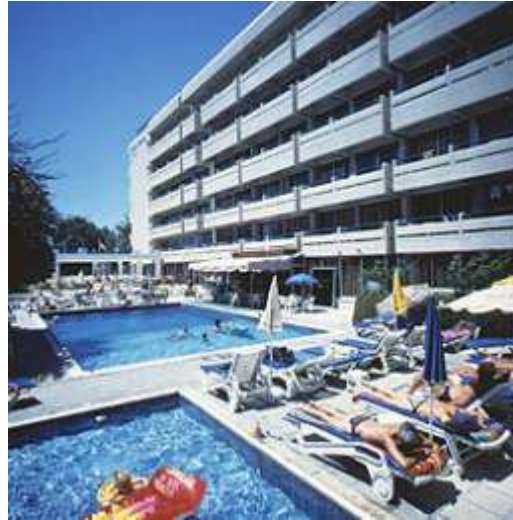
Above: Arsinoe Beach Hotel ( www.arsinoe-hotel.com )