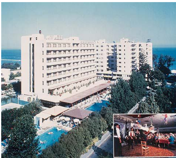
Above: Kanika Pantheon Hotel ( www.kanikahotels.com )