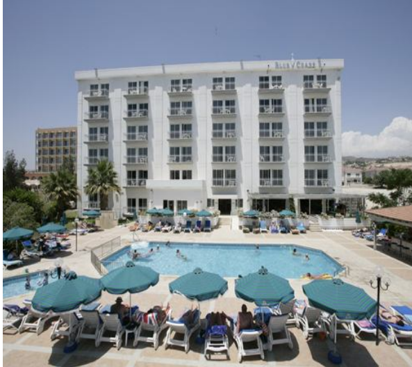
Above: Blue Crane ( www.bluecranehotel.com )