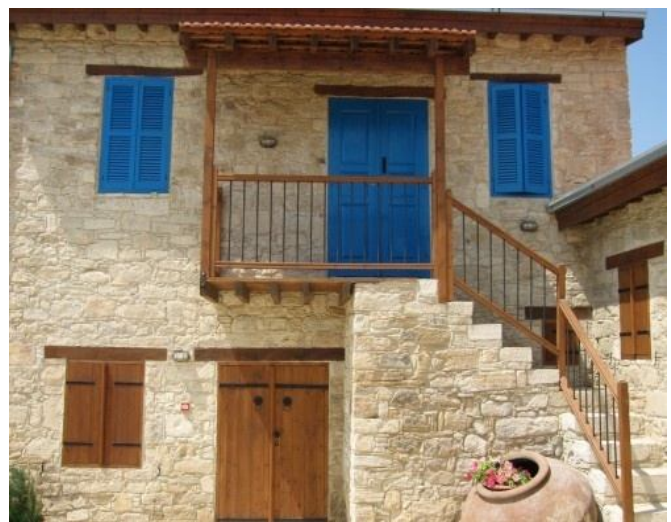
Above: Niki's House ( www.nikishouse.com )